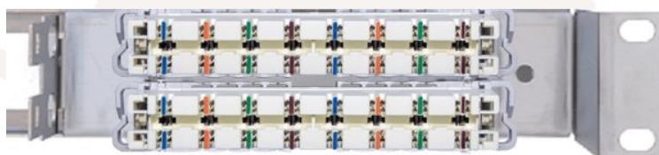
Example of sub-rack mounting